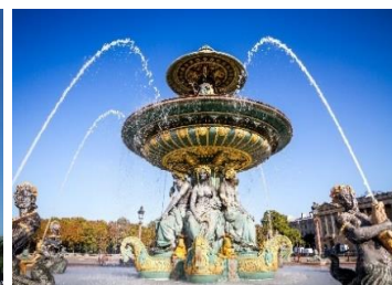
Place de la Concorde